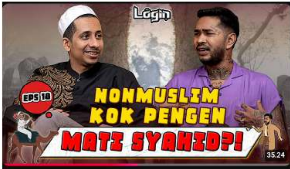
YouTube Log In Episode 18 Thumbnail 1

The concept of jihad often becomes a controversial topic due to widespread misunderstandings in society (Darmawan, 2018). In many cases, jihad is associated with violence, warfare, or acts of extremism, largely influenced by unbalanced reporting and negative narratives in social media (Zaduqisti, 2019). However, in Islamic teachings, jihad carries a broader and more positive meaning, referring to struggles in various aspects of life to achieve goodness and justice (Khairah, 2008; Sudianto, 2018; Naya, 2015). This challenge calls for digital da'wah to serve as an educational tool (Rumata et al., 2021), not only introducing the true meaning of jihad but also correcting the public's misconceptions (Wahyudi, 2021).