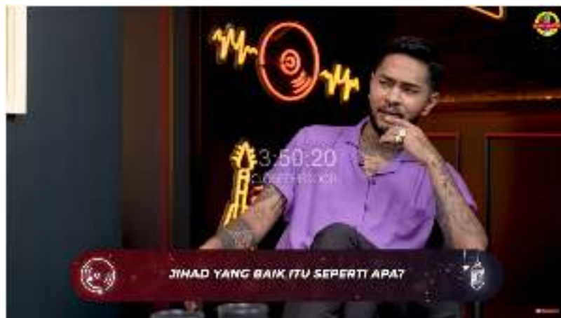
Figure 1 Clip of the YouTube Program