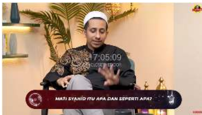
Figure 2 Clip of the YouTube Program