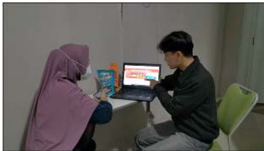
Figure 6. Outreach activities for customers of the Bagio grocery store.

Customers can choose payment methods according to their preferences. Shopee Marketplace also has a capable logistics network. Shopee Express is an official logistics company explicitly established to serve consumers from Shopee Marketplace and speed up the process of sending goods. The Shopee marketplace provides data analysis tools and sales reports that can help the MSMEs of Bagio Grocery Stores understand sales trends, customer behavior, and product performance so that they can help increase customer satisfaction.