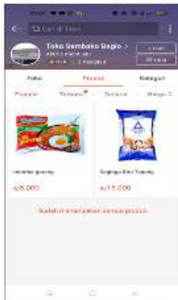
Figure 5. Display of the MSME Profile of the Bagio Grocery Store on the Shopee Marketplace.

In the picture above is a display of the Shopee UMKM Marketplace, Bagio Basic Food Store. The Shopee marketplace offers various features, from promotions to sales, that can help grocery stores increase their application ratings. One of the features offered by the Shopee company is Shopee Mall; through this feature, grocery stores can build customer trust by showing that the products sold have been verified and have good quality standards. Store rating and review features can help build trust for potential customers. Shoppe also provides another interesting feature in the form of free shipping. It is very profitable for grocery store owners because it makes it easier for customers to get the needed products without additional shipping costs. With the free delivery feature for consumers, the Bagio Grocery Store MSMEs are expected to be able to reach more consumers, especially in areas far from the city center. This increases competitiveness between grocery stores and positively impacts community welfare by facilitating access to basic food needs.