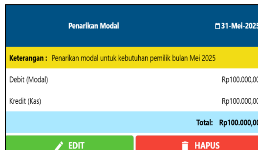
Figure 6. Capital Withdrawal

Capital withdrawals by the owner are typically carried out at the end of each month. Accordingly, when the transaction is recorded in the SIAPIK application, the system automatically generates the following journal entry: