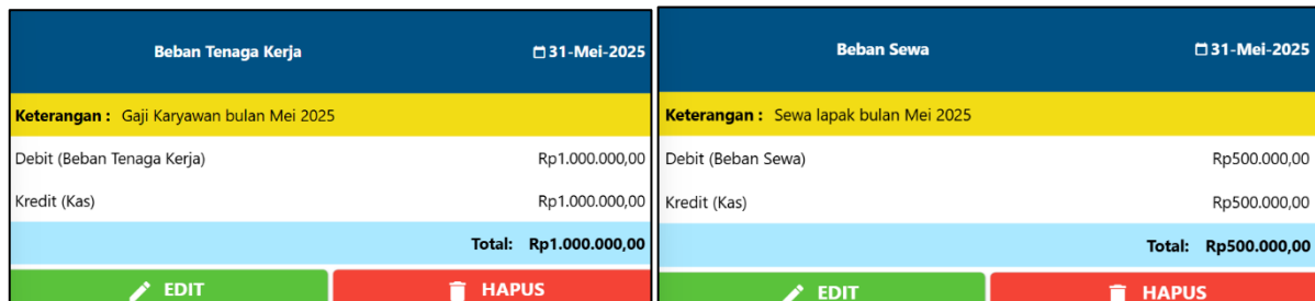
Figure 5. Operating Expense Journal

Operating expenses transactions that occur during operations such as rent expenses and labor costs are typically recorded at the end of each month. Accordingly, when the transaction is entered into the SIAPIK application, the system automatically generates the following journal entry: