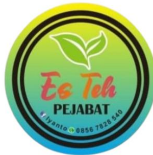
Figure 1. Logo of Es Teh Pejabat

Es Teh Pejabat is a franchise-based beverage business operating in the culinary sector, specializing in tea-based drinks. It has two outlets located in South Tangerang, the first outlet located in Pondok Ranji, the second outlet is situated in Ceger, Indonesia, established in September 2023, and the second in Ceger, opened in May 2024. The business operates six days a week, from 09:30 AM to 9:00 PM.